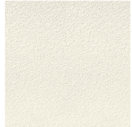
USG Boral Ensemble™ Spray-Applied Finish