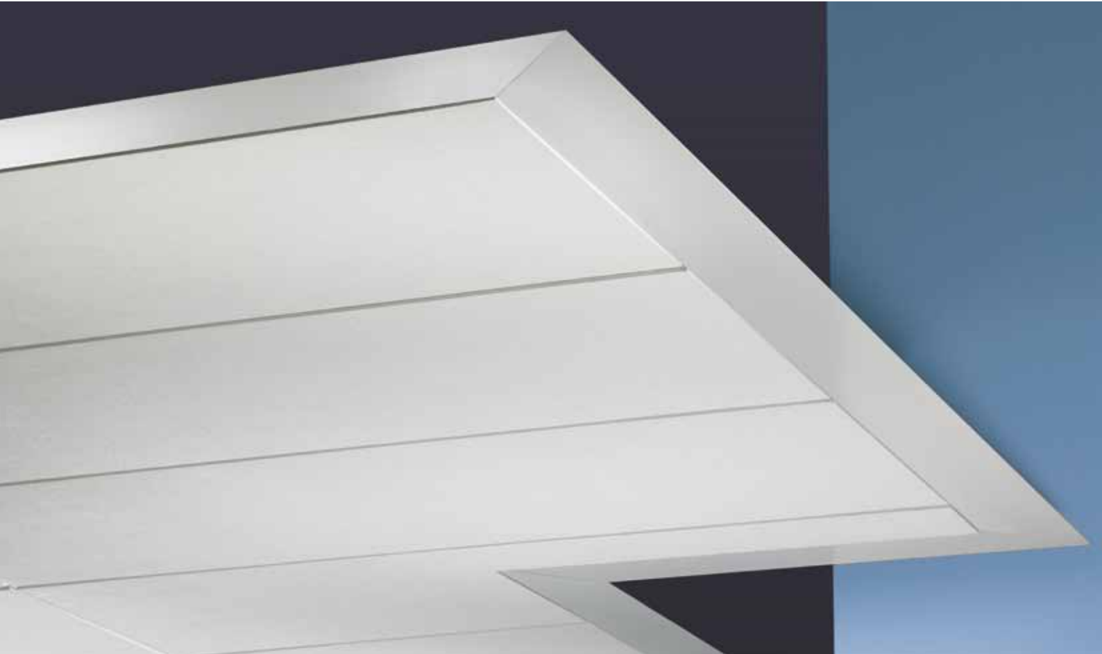
COMPASSO Slim Perimeter Trim