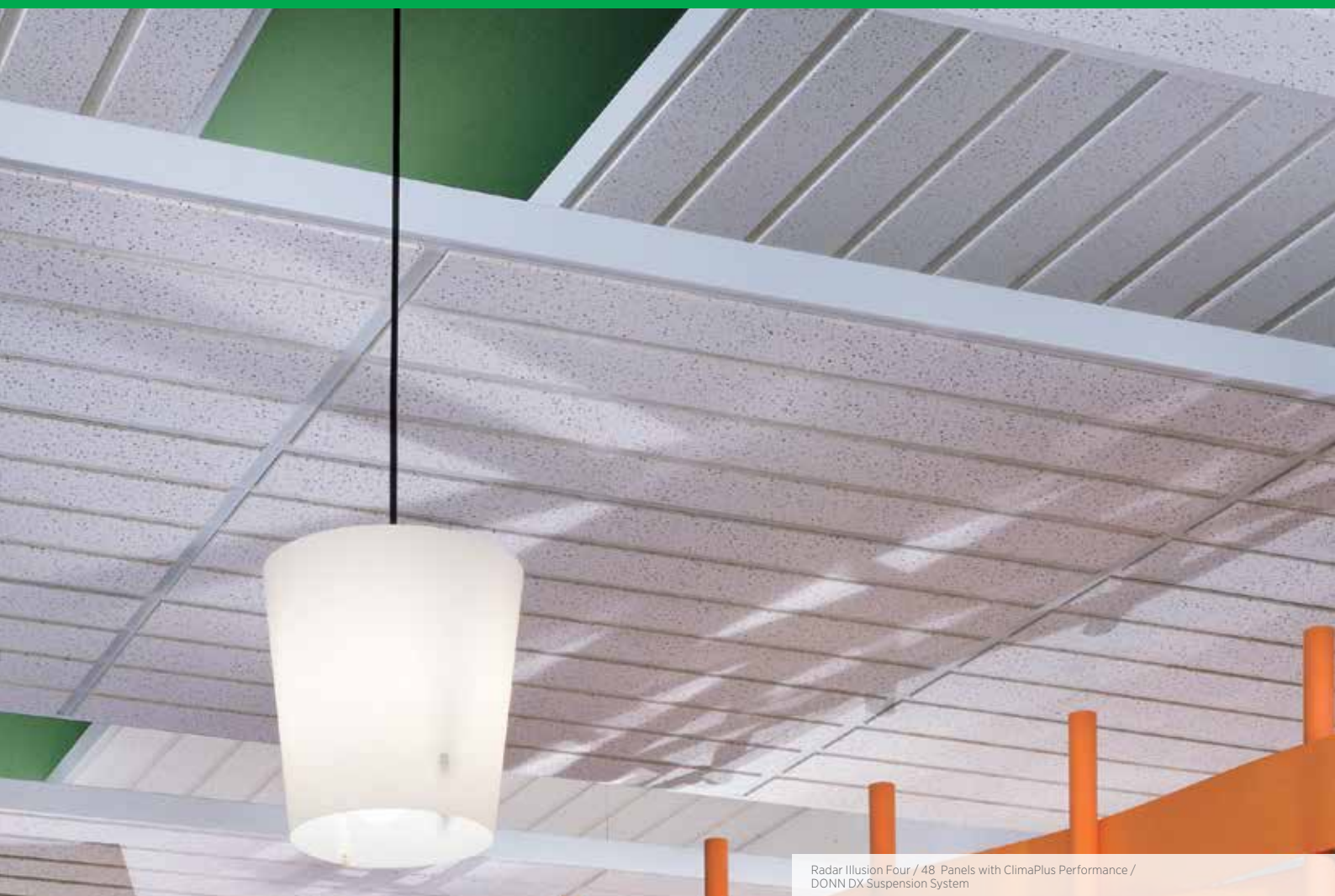
Radar Illusion Four / 48 Panels with ClimaPlus Performance / DONN DX Suspension System